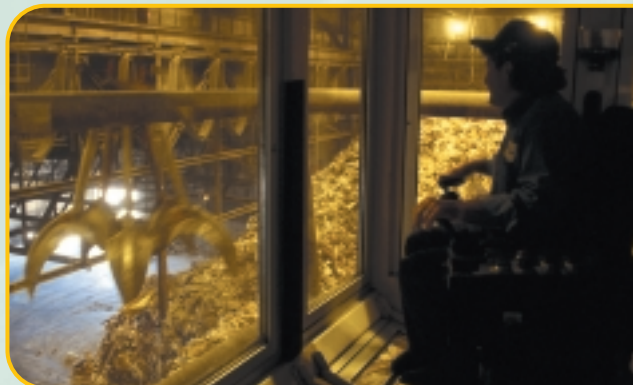
Wheelabrator facilities are specifically designed for the total destruction of large quantities of waste products, including confidential documents.

Wheelabrator facilities meet all relevant local, state and federal environmental standards and are subject to the scrutiny of both internal and external environmental audits. They use a highly reliable and technically advanced combustion system known as "mass-burn" technology to process the incoming waste. This high-temperature process typically exceeds 2,500 degrees F, which is more than sufficient to destroy any waste material that requires assured destruction.