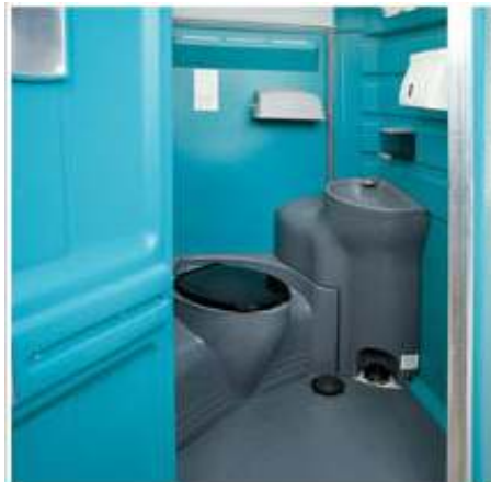
Fresh Flush model with sink