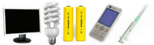
Hazardous waste (see Special Handling section)