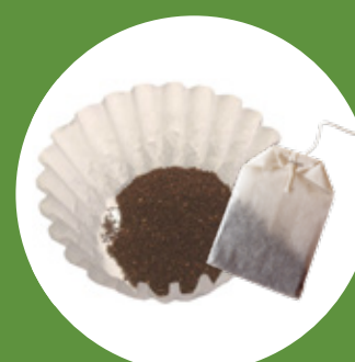
Coffee grounds & tea bags