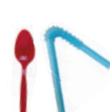
Utensils & straws