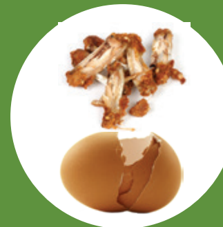
Bones & shells