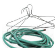
Hoses & wire