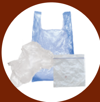
Loose plastic bags/wrap, disposable gloves