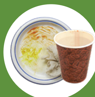
All food-soiled paper