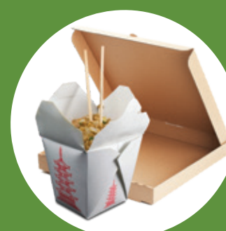
Paper take-out & pizza boxes