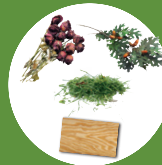
Plant debris & clean wood