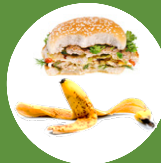
All food waste, peels, pits, & cores