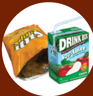
Drink & soup boxes, snack bags