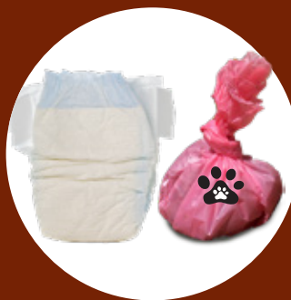
Diapers & pet waste