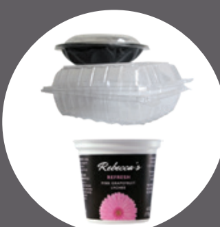
Rigid plastic containers