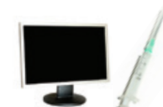
Hazardous waste (see Special Handling section)