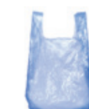
Loose plastic bags