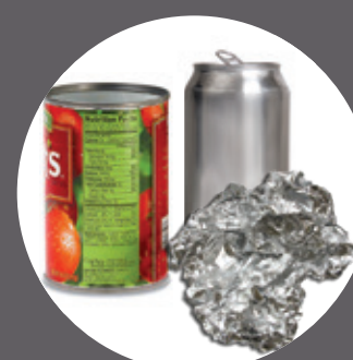
Cans, foil, & scrap metal