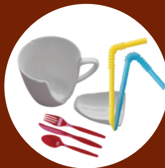
Broken glassware & ceramics, plastic straws & utensils (Reusable items should be donated)