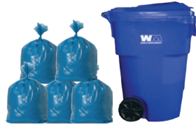
Recycle Large – 96-gallon cart 45.7x28.5x33.7

Waste, green waste and recycling is collected each week.