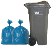
Waste Small – 35-gallon cart 39x20x23

Use the small 35-gallon waste cart and save money!