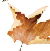
Grass, Weeds, Green Plants, Tree Limbs, Wood Chips, Dead Plants, Brush, Garden Trimmings, Leaves, Cut Flowers

(Please place palm fronds, yucca and cacti in the Trash)