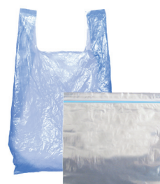
Plastic Wrap, Bags & Other Plastic Film