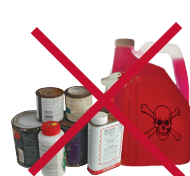
No Hazardous Waste Contact Yolo County at (800) 207-8222