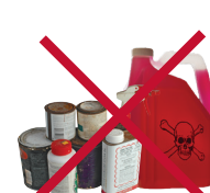
No Hazardous Waste Contact Yolo County at (800) 207-8222