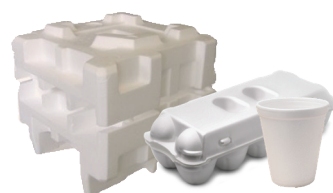
Polystyrene Foam & Packaging (Including Foam Egg Cartons)