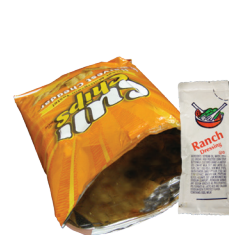
Snack & Chip Bags, Candy Wrappers & Condiment Packages

Please use paper or ASTM D6400 rated compostable bags only to collect organics.