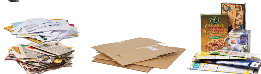
Clean Paper, Magazines, Newspaper, Junk Mail, Cardboard, Cardboard Egg Cartons, Cereal Boxes