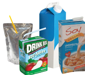
Beverage Pouches & Aseptic & Gable-Top Cartons