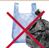
No Plastic Bags, Plastic Coated Bags or Plastic of Any Kind