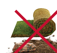
No Dirt, Rock, or Sod