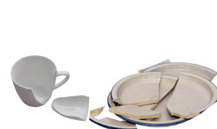
Broken Glass & Dishes (Please Wrap)