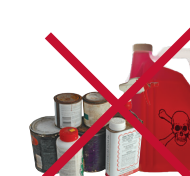
No Hazardous Waste Contact Yolo County at (800) 207-8222