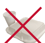
No Polystyrene Foam