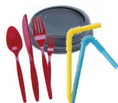
Cup Lids, Plastic Utensils, Plastic Straws (Including Compostable)