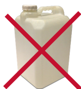
No Fats, Oil, or Grease

Reminder: Treated wood not accepted in any curbside cart or bin. Contact the Yolo County Landfill at 916-617-4656 for disposal options.