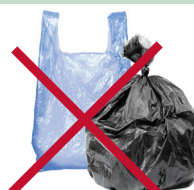
No Plastic Bags