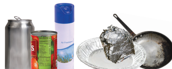
All Metal Beverage & Food Cans, Empty Aerosol Cans, Clean Aluminum Pans & Foil, Small Scrap Metal (Up To 20 Pounds)