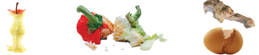
Food Scraps, Including Egg Shells, Meat & Bones, Pizza Boxes, Carboard Egg Cartons, Coffee Grounds & Any Food-Soiled Paper

Used Cooking Oil? Take to the West Sacramento Public Works Corporation Yard at 1951 South River Road (M-F, 8 a.m. to 3 p.m.)