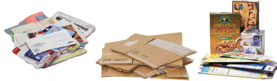
Clean Paper, Magazines, Newspaper, Junk Mail, Cardboard, Cereal Boxes

Please do not bag recyclables, keep loose. Please empty all containers prior to recycling.