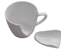
Broken Glass & Dishes (Please Wrap)