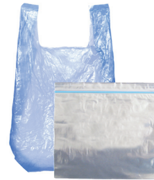
Plastic Wrap, Bags & Other Plastic Film