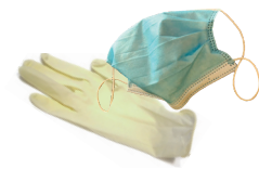
Disposable Gloves & Masks