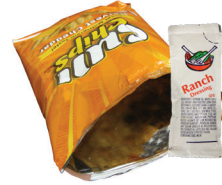
Snack & Chip Bags, Candy Wrappers & Condiment Packages