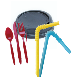
Cup Lids, Plastic Utensils, Plastic Straws (Including Compostable)