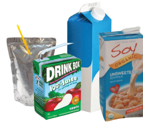
Beverage Pouches & Aspectic & Gable-Top Cartons