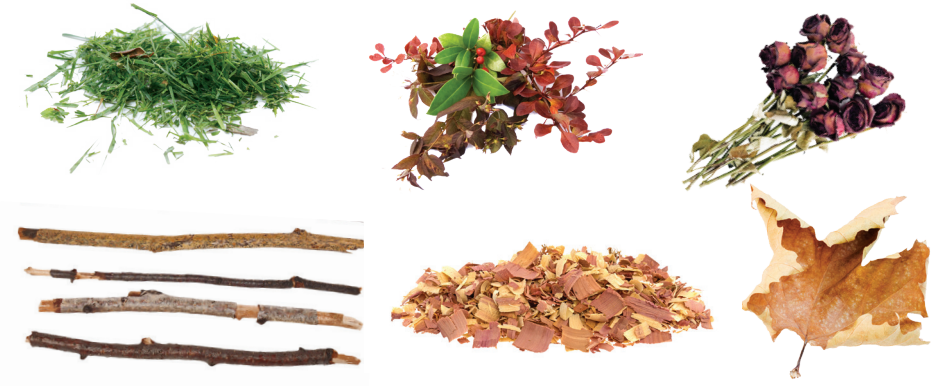
Grass, Weeds, Green Plants, Tree Limbs, Wood Chips, Dead Plants, Brush, Garden Trimmings, Leaves, Cut Flowers (Please place palm fronds, yucca and cacti in the Trash)

Please use paper or ASTM D6400 rated compostable bags only to collect organics.