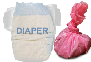
Diapers & Pet Waste