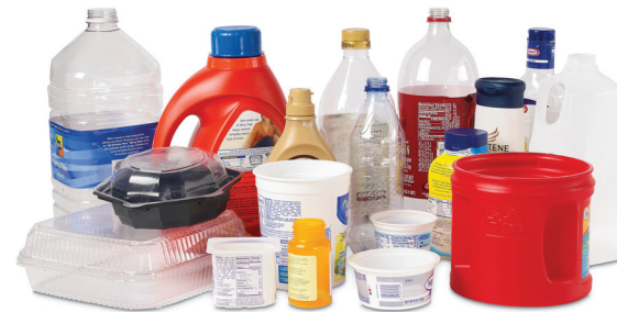
Empty Plastic Bottles, Rigid Plastic Containers, Plastic To-Go Containers (#6 not accepted)