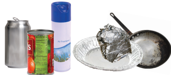
All Metal Beverage & Food Cans, Empty Aerosol Cans, Clean Aluminum Pans & Foil, Small Scrap Metal (Up To 20 Pounds)