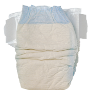
Diapers and Pet Waste