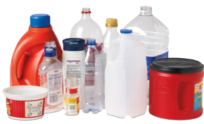
Plastic Bottles and Containers