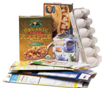
Clean Paper Bags, Magazines, Cardboard, Newspaper, Junk Mail and Paper

Cal Sierra Transfer Station Location and Hours 19309 Industrial Dr. Sonora, CA 95370 7 days a week, 8:00 a.m. – 4:45 p.m. 209-536-1719