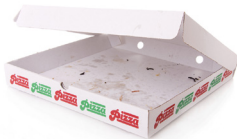
Food Soiled Paper