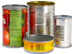
Aluminum Cans, Containers and Clean Foil