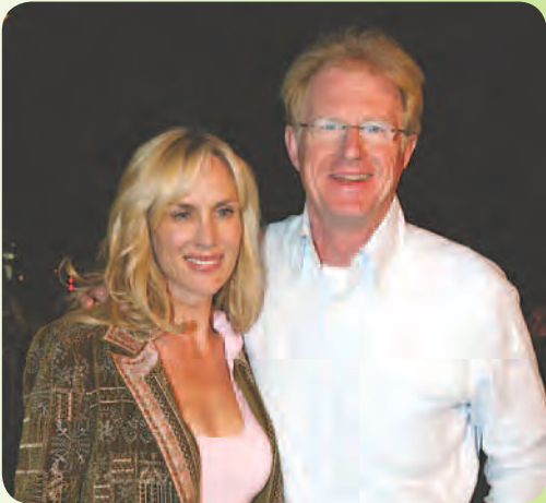
Ed Begley, Jr. Living Like Ed

Just by simply choosing healthful options every day, you can make a world of difference. You can improve your own health and the health of the environment. It’s just like choosing to change your lightbulbs or draw your drapes. Just like choosing to drive a greener car. Just like choosing to recycle and buy recycled. Just like choosing to reduce your energy needs and get your energy from greener sources. Just like choosing to eat locally grown, organic food. It’s all about choices. And you’ve got the power to choose.