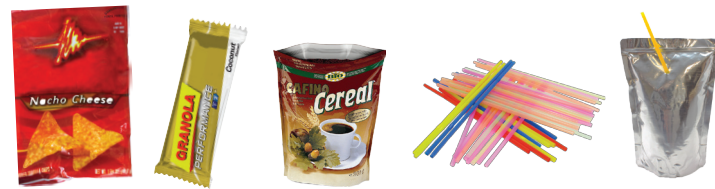
Food Wrappers, Straws, & Juice Pouches

Do not place Household Hazardous Waste or electronic waste in the trash cart. For proper handling, please see the Household Hazardous Waste panel.