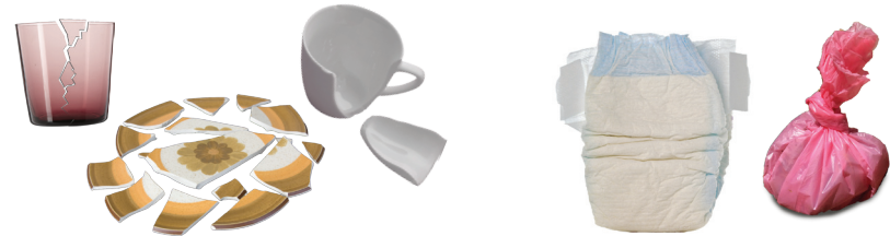
Broken Glass & Ceramics