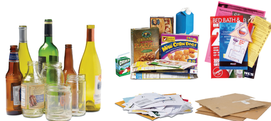
Empty Glass Bottles & Jars

When in doubt if an item is recyclable, place it in the trash cart.