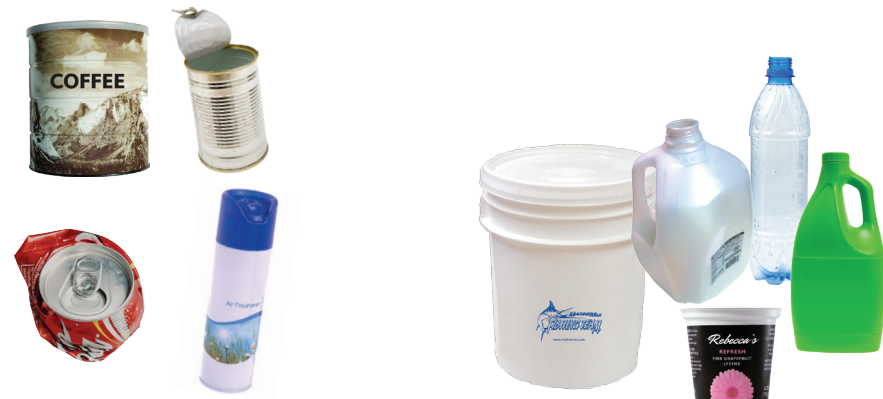
Empty Aluminum, Tin & Steel Cans