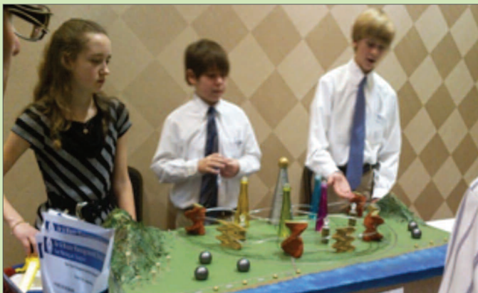
Orion's St. Joe's students

The Michigan Regional Future City Competition has been taking place for nine years. Future City is a cross-curricular educational program where students in 6th, 7th and 8th grades imagine, design and build cities of the future. In 2013, the theme required students to design a city including recycling as a major component and Waste Management assisted in developing the judging criteria. In 2014, the theme was Tomorrow's Transit: Designing a way to move people in and around a city. Student imagination was absolutely astounding.