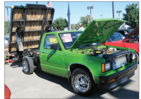
Batteries are located below the truck bed

versus gasoline! Bob has a timer that is set to charge the vehicle late at night when the energy rates are lower and can get 30 to 40 miles on an electric charge, which converts to approximately 60 cents per mile depending upon the price of gasoline. Bob Warnke is a tool maker by trade and owns his own tool and die business in Oxford.