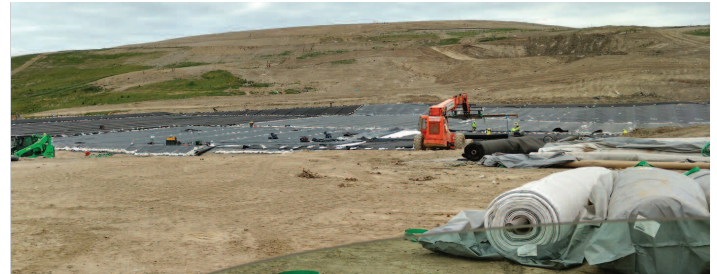
This view is facing east into Cell 12b.

In addition to new Cell 12a completed last summer, throughout the month of June, Waste Management completed the installation of Cell 12b. Cell 12b is to the north of Cell 12a and was not as visible from Silver Bell as Cell 12a installation was in 2015. Waste Management will begin disposing of waste in Cell 12b this September.