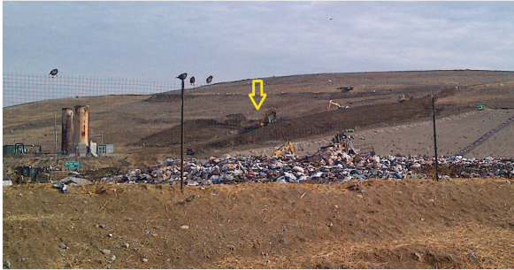
Excavation to remove sump pump from area west of old Cell 1

Throughout the winter and early spring, residents and neighbors observed Waste Management excavating on the west side of old Cell 1 to remove the existing sump that pumps leachate from the landfill to the Detroit Water and