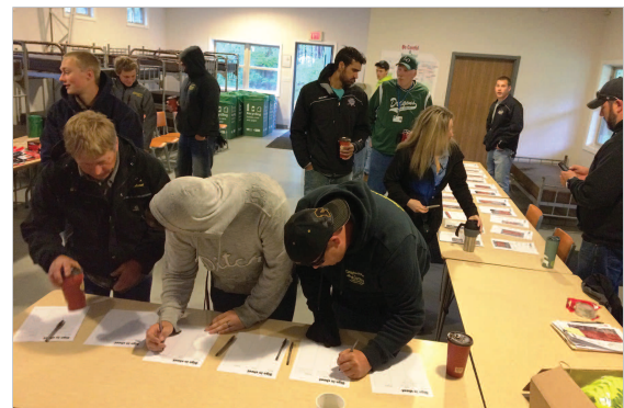
Green Up event volunteers