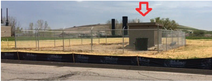
New sewer pumping station on east side of Giddings Rd. north of Silverbell Rd.

Sewer Department through a sewer connection. Leachate is precipitation (rain and/or snow) that mixes with the waste. A new sump has been located and installed at Giddings Rd. near Silverbell. Waste Management pumps approximately 25,000 to 30,000 gallons of leachate a day to be recycled. That's about the volume of an average swimming pool.