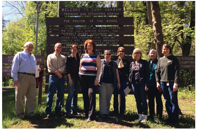
WHC Meeting Members from MSU, ITC, DTE Energy, GM, Orion Twp., WM, GM, WHC and DTE Energy