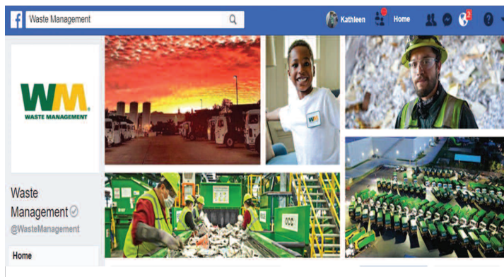
Waste Management Facebook page

Twitter links: https://twitter.com/kathyklein4 https://twitter.com/WasteManagement