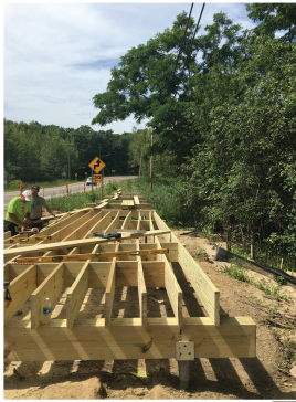
Clarkston Road boardwalk under construction and completed

Waste Management pays host community fees to Orion Township for serving as a host community to Eagle Valley Recycling and Disposal Facility. Orion Township uses those host community fees to benefit