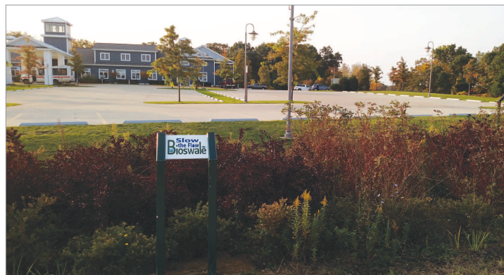
Bioswale sign at Orion Center

the nation. You can learn more about green infrastructure by visiting the Environmental Protection Agency's website at https://www.epa.gov/green-infrastructure/what-green-infrastructure