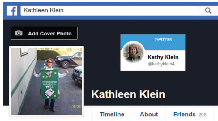
Local Facebook and Twitter pages

Twitter pages are shown below. You can “friend” these pages to stay up on the latest national and local news about Waste Management. Important local environmental efforts and volunteer stewardship opportunities are also posted from time to time.