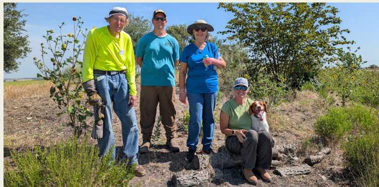
NPSOT volunteers at the garden.

Williamson Co. Landfill 600 Landfill Road Phone: (512) 759-8881 Fax (512) 759-5004