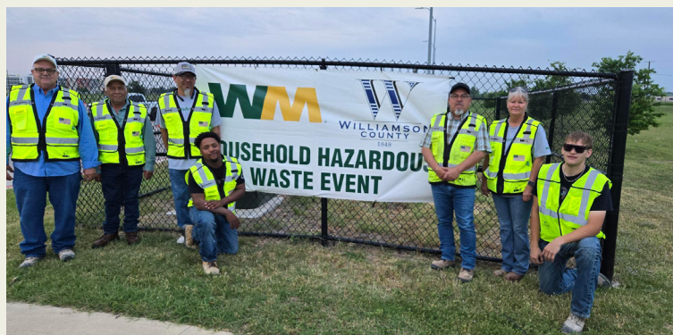
The Williamson County Landfill team at the Spring HHW event in Hutto.

Thank you for taking the time to stay informed, and for your partnership in supporting our shared goal of a cleaner, more sustainable community. We're proud to serve Williamson County and look forward to keeping you updated.