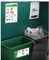
Place clean, dry materials in recycling container.