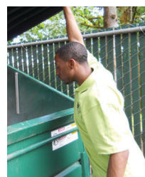
Double check recycling bin to make sure it's free from contaminants; no plastic bags or liners and all recyclables are loose in the bin.