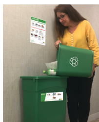
Consolidate smaller recycling containers into a larger, liner-free container.