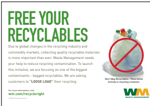
No Bagged Recyclables Label