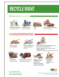
Recycle Right Poster