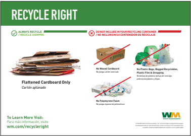
Recycling Container Label Cardboard Only