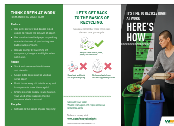
Recycle Right Brochure for Business