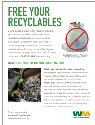
No Bagged Recyclables Handout