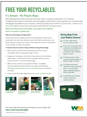
No Plastic Bag FAQ