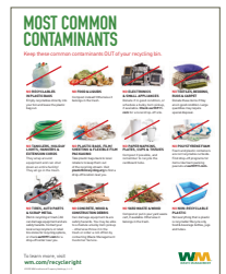
Most Common Contaminants Poster