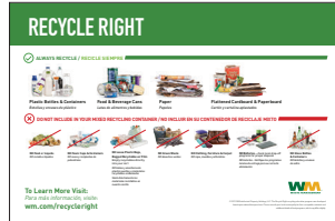
Recycling Cart Decal (Glass Not Accepted) (Download)