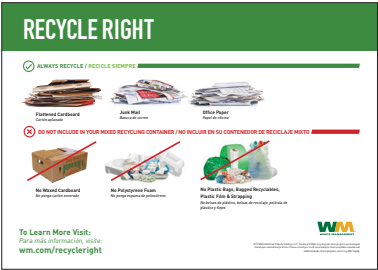
Recycling Container Label Mixed Fiber Only