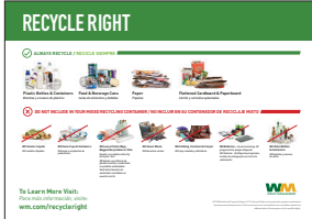
Recycling Bin Decal (Glass Not Accepted) (Download)

Download or call your Sales rep for recycling decals for your external containers.