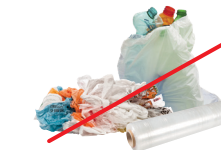
NO Loose Plastic Bags, Bagged Recyclables or Film Empty recyclables directly into your bin.