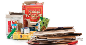
Flattened Cardboard & Paperboard