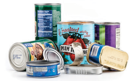
Food & Beverage Cans