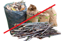
NO Green Waste