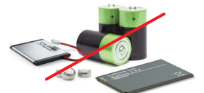
NO Batteries – check local drop-off programs for proper disposal