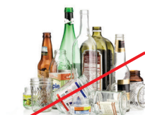
Glass Bottles & Containers