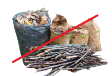
NO Green Waste

Empty recyclables directly into your bin.