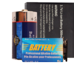
NO Batteries Check local drop-off programs for proper disposal