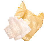
NO Loose Plastic Bags, Bagged Recyclables or Film Empty recyclables directly into your bin.