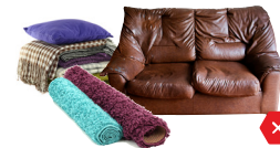
NO Clothing, Furniture & Carpet