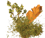
NO Green Waste