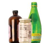
NO Glass Bottles & Containers