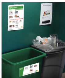
Place clean, dry materials in recycling container.