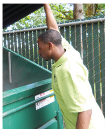
Double check recycling bin to make sure it's free from contaminants; no plastic bags or liners and all recyclables are loose in the bin.