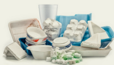
FOAM CUPS & CONTAINERS