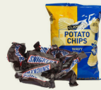
CANDY, SNACK & FOOD WRAPPERS