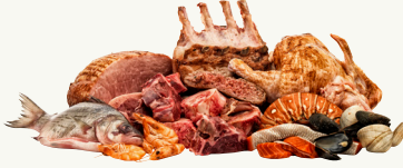
Meat, Fish & Poultry