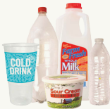
Plastic Bottles, Cups & Containers