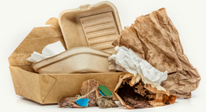
Food Soiled Paper, Coffee Filters & Tea Bags