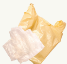
Plastic Bags & Film