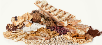
Bread, Pasta, Rice & Grains

The California State Legislature has enacted Senate Bill 1383 (SB 1383), which mandates that cities reduce the disposal of organic waste by 75% by the year 2025. All businesses, multifamily residences, and individual households in California are required to separate food scraps and yard debris from regular trash and place them in designated organics carts.