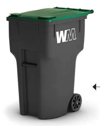
DO NOT INCLUDE: LOOSE PLASTIC BAGS SERVEWARE/UTENSILS PLASTIC CONTAINERS FOAM CONTAINERS HAZARDOUS WASTE