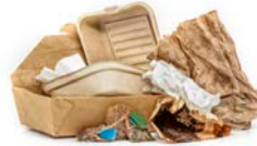
Food Soiled Paper, Coffee Filters & Tea Bags