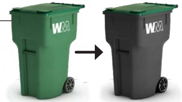
Old Color Scheme New Color Scheme

Ensure food scraps are placed in a plastic bag or paper bag before placing in your organics cart.