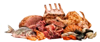
Meat, Fish & Poultry