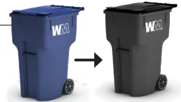
Old Color Scheme New Color Scheme