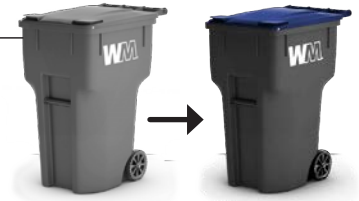
Old Color Scheme New Color Scheme

Place recyclables directly into your recycling cart - Don't bag your recycling materials.