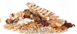
Bread, Pasta, Rice, Grains, Coffee Grounds

Ensure food scraps are placed in a plastic bag or paper bag before placing in your organics cart.