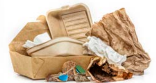
Food Soiled Paper, Coffee Filters & Tea Bags