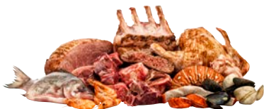
Meat, Fish & Poultry