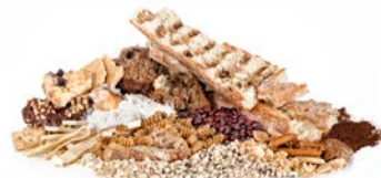
Bread, Pasta, Rice, Grains, Coffee Grounds