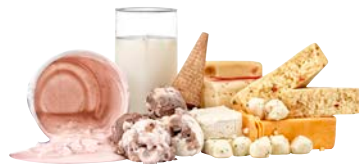
Dairy No liquid should be discarded directly in the bin.