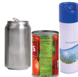
All Metal Beverage & Food Cans, Aerosol Cans