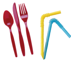
Plastic Utensils, Plastic Straws