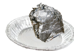
Clean Aluminum Pans & Foil Small Scrap and Cast Aluminum (up to 20 pounds)