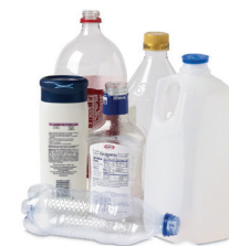
Empty Plastic Bottles, Rigid Plastic Containers