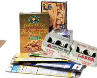
Clean Paper, Magazines, Newspaper, Junk Mail, Cardboard Egg Cartons