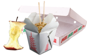
Food Scraps, Food- soiled Paper (Pizza Boxes, Napkins, Take- out Containers)