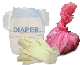
Diapers, Pet Waste, Disposable Gloves