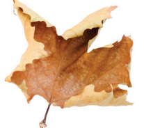
Grass, Weeds, Green plants, Tree limbs, Wood chips, Dead plants, Brush, Garden trimmings, Leaves

Holiday tree collection runs December 26 until January 22. Holiday trees may be placed inside or bundled next to your green waste cart. They should be cut into sections no longer than 3 feet and be free of tinsel, flock and other decorations.