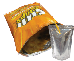
Snack & Chip Bags, Candy Wrappers, Juice Pouches