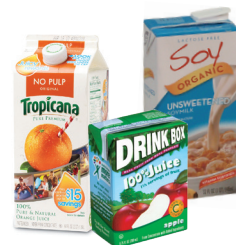
Aseptic Containers, Gable-top Cartons