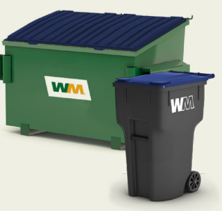
DO NOT INCLUDE: FOOD OR LIQUIDS PLASTIC BAGS OR FILM FOAM CONTAINERS CLOTHING, FURNITURE, OR CARPET BATTERIES ELECTRONICS HAZARDOUS WASTE YARD WASTE