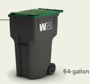
DO NOT INCLUDE: PLASTIC BAGS OR FILM SERVEWARE/UTENSILS PLASTIC CONTAINERS FOAM CONTAINERS HAZARDOUS WASTE FATS, OILS, OR GREASES