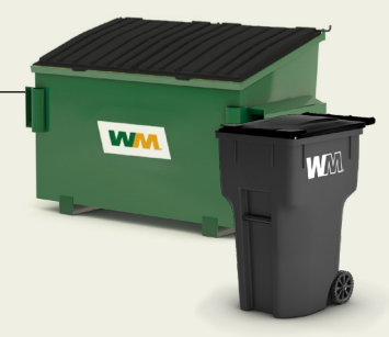
DO NOT INCLUDE: ORGANICS/RECYCLABLES HAZARDOUS WASTE ELECTRONICS BATTERIES, TIRES, OR PAINT FLAMMABLE MATERIAL