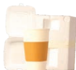
Foam Cups & Containers