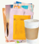
Paper & Paper Cups