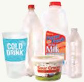
Plastic Bottles, Cups & Containers