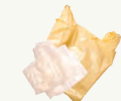
Plastic Bags & Film

Do Not Include: Food Waste Recyclables Hazardous Waste Electronics Batteries, Tires or Paint Flammable Material