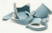
Broken Ceramic Dishes & Pots