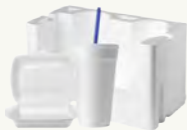
Foam Cups, Containers & Straws