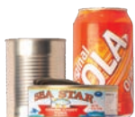
Food & Beverage Cans