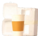
Foam Cups & Containers