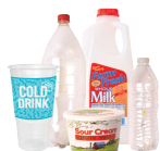
Plastic Bottles, Cups & Containers