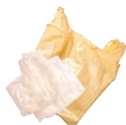
Plastic Bags & Film