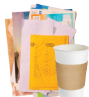
Paper & Paper Cups