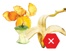
No Food Or Liquids.