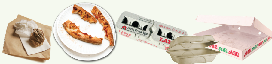
Food Soiled Paper, Napkins, Paper Towels, Pizza Boxes, Cardboard Egg Cartons, Non-coated Take-out Containers & Paper Plates (No Surface Sheen)