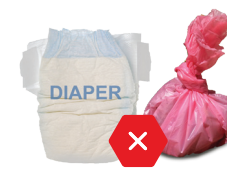
No Diapers Or Pet Waste