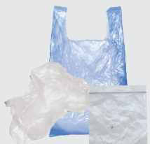
Plastic Wrap, Bags & Other Plastic Film