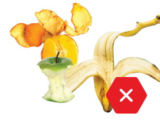
No Food Or Liquids.