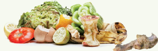
Food Scraps, Including Egg Shells, Meat & Bones

Collect food scraps into a reusable container then empty into cart or place them in a paper bag, then dispose paper bag in green cart. Plastic bags of any kind (including those labeled compostable) are not accepted. Surcharges may apply.