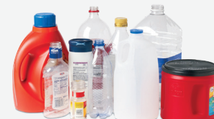
Empty Plastic Bottles & Jugs (Lids Should Be Left On After Emptying)