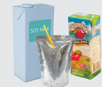
Drink & Beverage Cartons, Boxes / Pouches (Multi-Material Packaging)