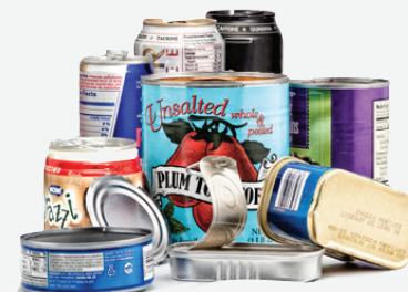
Empty Metal Beverage & Food Cans, Aerosol Cans, Clean Aluminum Pans & Foil