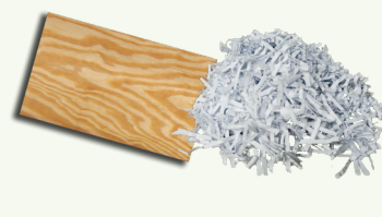
Untreated Wood, Shredded Paper