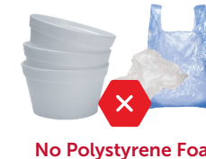
No Polystyrene Foam No Plastic Bags/Film