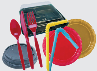
Plastic Utensils, Straws, Cup Lids & To-Go Containers