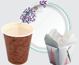
Disposable Drink Cups, Plastic Lined/ Coated Plates & To-Go-Containers (With Surface Sheen)