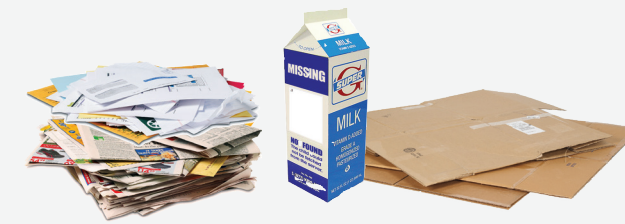
Clean Paper, Magazines, Newspaper, Cardboard, Junk Mail, Paper Beverage Cartons (must be empty)

Do not place recyclables in a plastic bag. Empty first then place plastic bag in the trash. Plastic bags of any kind are not accepted. Surcharges may apply if contamination is found.