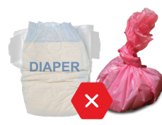
No Diapers or Pet Waste