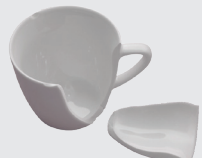
Broken Glass & Dishes