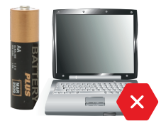
Batteries & Electronics