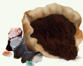
Coffee Grounds & Tea Bags