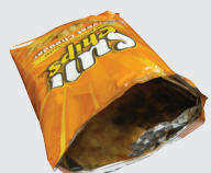
Snack & Chip Bags, Candy Wrappers

Visit the RE:Source guide at resource.StopWaste.org for questions about reuse, repair, recycling and safe disposal options for everything from electronics and clothes to furniture and bicycles.