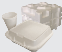
Polystyrene Foam & Packaging