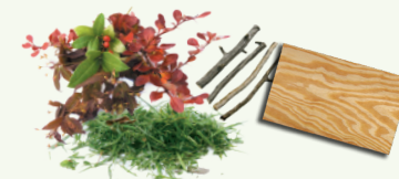
Yard Waste, Untreated Wood

Plastic cups, straws, or utensils that are labeled "compostable" or "biodegradable" are not allowed in the Organics containers.