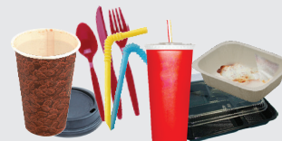
Plastic Lined Paper Cups & Lids, Plastic Utensils & Straws, To Go Containers (Including "compostable" plastic)