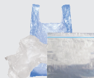
Plastic Wrap, Bags & Other Plastic Film