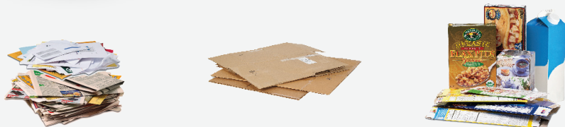
Clean Paper, Magazines, Newspaper, Cardboard, Junk Mail, Paper Beverage Cartons (must be empty)