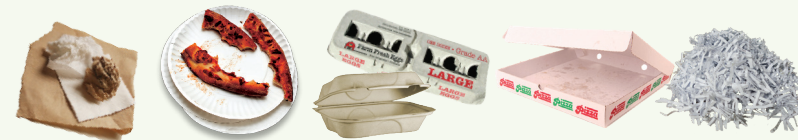
Food-Soiled Paper, Napkins, Paper Towels, Pizza Boxes, Cardboard Egg Cartons, Non-coated (plastic lined) Take-out Containers & Paper Plates (No surface sheen), Shredded Paper