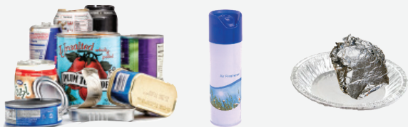
All Metal Beverage & Food Cans, Empty Aerosol Cans, Clean Aluminum Pans & Foil