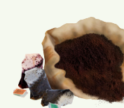
Coffee Grounds & Tea Bags