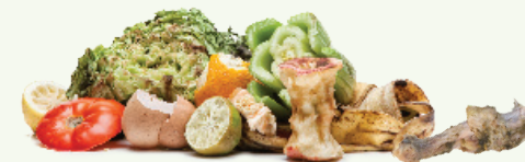
Food Scraps, Including Egg Shells, Meat & Bones