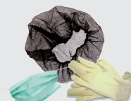
Disposable Gloves & Hairnets