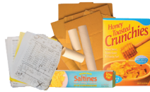
Paper, Flattened Cardboard & Paperboard