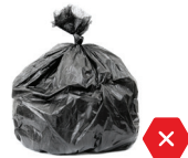
NO Plastic Bags Clear or BPI-certified Bags only Allowed in Organic Bins (not carts)