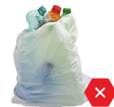
NO Plastic Bags, Keep Recyclables Loose