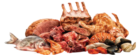
Meat, Fish & Poultry