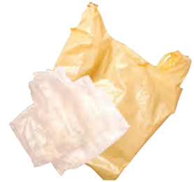
Loose Plastic Bags and Film