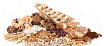
Bread, Pasta, Rice, Grains, Coffee Grounds