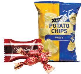
Candy, Snack & Food Wrappers