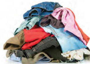
Clothing & Textiles