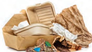
Food Soiled Paper, Coffee Filters & Tea Bags

Place organics material directly into your organics cart or place your organics material in a compostable bag and place your bagged organics into your cart.