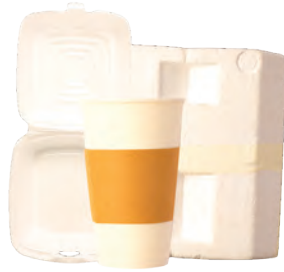
Foam Cups & Containers