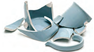
Broken Ceramic Dishes & Pots