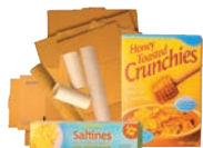
Flattened Cardboard & Paperboard