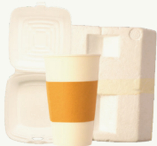
Foam Cups & Containers