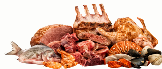
Meat, Fish & Poultry