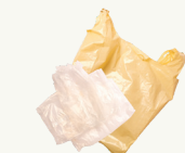
Plastic Bags & Film

Organics/Recyclables, Electronics, Batteries, Tires or Paint, Flammable Material, Needles