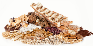
Bread, Pasta, Rice, Grains, Coffee Grounds

Place food waste directly into your kitchen pail - don't bag your food waste.