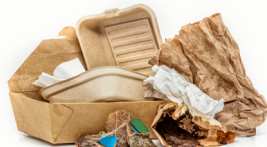
Food Soiled Paper, Coffee Filters & Tea Bags