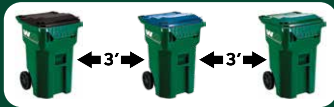
Trash Recyclables Yard Waste