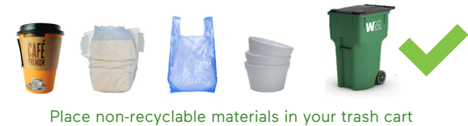
Place non-recyclable materials in your trash cart