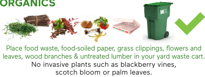
Place food waste, food-soiled paper, grass clippings, flowers and leaves, wood branches & untreated lumber in your yard waste cart. No invasive plants such as blackberry vines, scotch bloom or palm leaves.