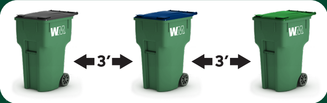
Trash Recyclables Organics