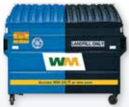
3-cubic yard Recyclables & Landfill Split Bin

A split bin (recyclables and landfill) option is available.