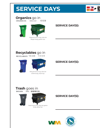
Service Day Sign