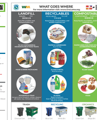
What Goes Where Sorting Flyer