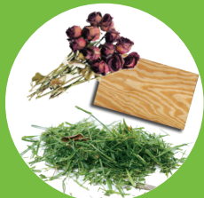
PLANT DEBRIS & UNTREATED/RAW WOOD