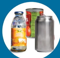
GLASS & METAL Food & beverage containers Must be empty