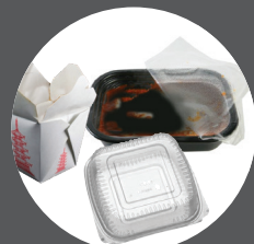
TO GO CONTAINERS & MICROWAVABLE FOOD TRAYS