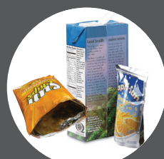
FOOD & DRINK PACKAGING