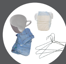
HOUSEHOLD ITEMS Hangers/wires (tangles), clothes, diapers/pet waste, toys, dishware & furniture