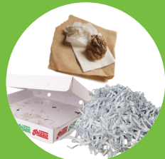
PAPER USED FOR FOOD OR DRINK