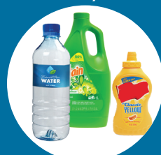
PLASTIC Hard containers / Size must be at least 4". Must be empty