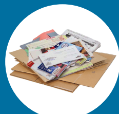
PAPER & CARDBOARD Must be dry & free of food