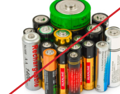
NO Batteries or Hazardous Waste