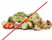
NO Food Waste