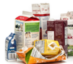
Food & Beverage Cartons