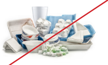
NO Foam Cups & Containers