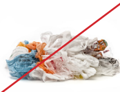
NO Plastic Bags & Film