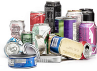
Food & Beverage Cans