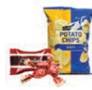
Candy, Snack & Food Wrappers