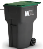
New Color Scheme