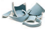
Broken Ceramic Dishes & Pots