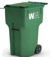
Old Color Scheme