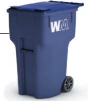
Old Color Scheme