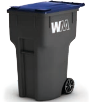
New Color Scheme