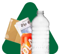
Recycle bottles, cans, paper and cardboard.

WM and City of Ridgecrest are working together to help residents get back to the basics of recycling.