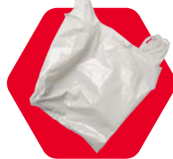
No loose plastic bags and no bagged recyclables.

Visit home.wm.com/ridgecrest to view your 2024 Collection Calendar and holiday schedule or to report a missed pickup.