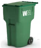
Old Color Scheme