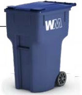
Old Color Scheme