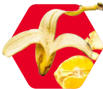
Keep food and liquid out of your recycling.