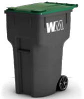
New Color Scheme