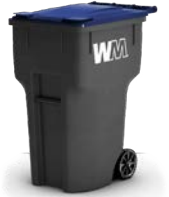
New Color Scheme