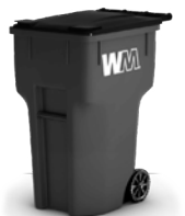
New Color Scheme