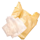
Plastic Bags & Film