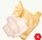
NO Loose Plastic Bags, Bagged Recyclables or Film Empty recyclables directly into your cart