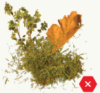
NO Green Waste