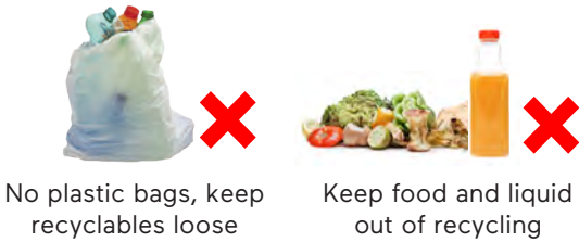
No plastic bags, keep recyclables loose Keep food and liquid out of recycling