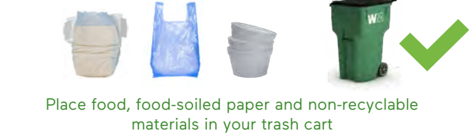
Place food, food-soiled paper and non-recyclable materials in your trash cart