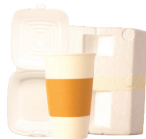
Foam Cups & Containers