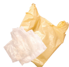
Plastic Bags & Film