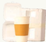
Foam Cups & Containers