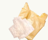
Plastic Bags & Film

Organics/Recyclables Hazardous Waste Electronics & CFL Bulbs Batteries, Tires or Paint Flammable Material